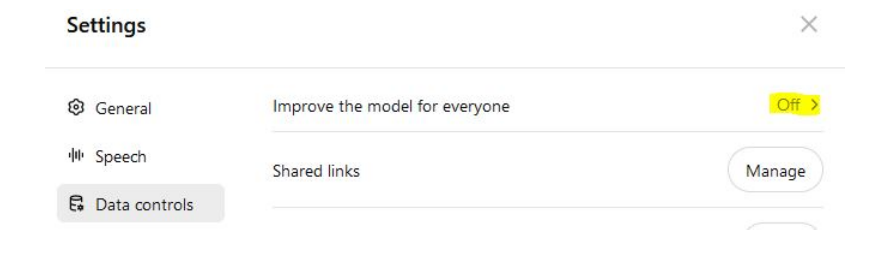
Try it here

Concerned about privacy? Go to your profile settings and turn off 'improve model for everyone' under 'Data controls'