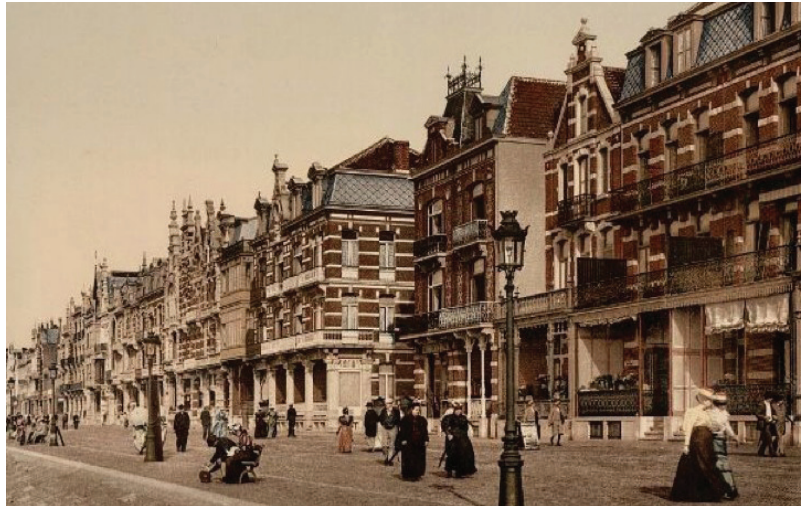
The promenade of Ostend around 1900.

Commissioned by: AGSO 2007-2008 Collaborators: P. Uyttenhove, M. Liefoghe