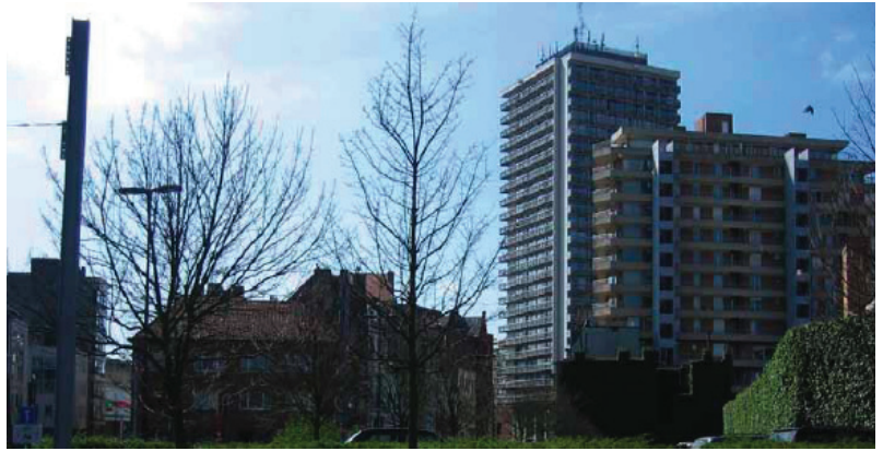
High rise at the Ernest Feys square.

A second component regards the conviction that the question around heritage cannot be approached solely from the scale of the building site, but include the perspective on the urban structure. Thirdly, city development cannot be entirely planned. Whatever dynamic occurring in the city that seems impossible to subject to any limiting condition, has to be followed up process-wise. Therefore, the implementation of the proposed methodology in a spatial policy, will call for a search for suitable planning and policy instruments that fulfil these three components.