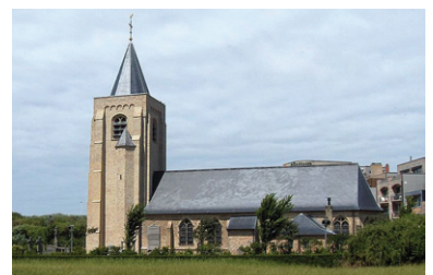
Onze-Lieve-Vrouw-ter-Duinen church in Mariakerke (photo © De Smet Vermeulen architecten).