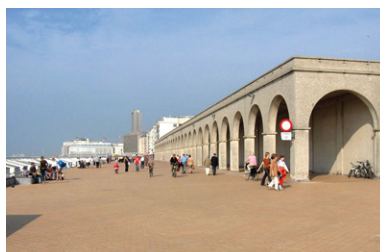
The Venetian galleries (photo © De Smet Vermeulen architecten).