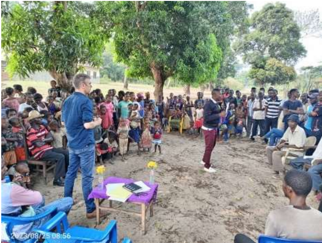
Community meeting about carbon credits with the extension worker