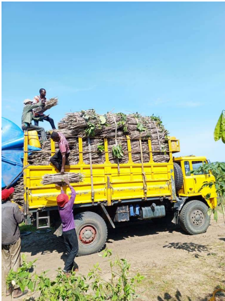
Cassava tubers for intercropping by womentract