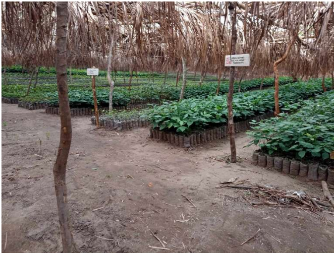
Images of the tree nursery supplying the Ingung Matende site.