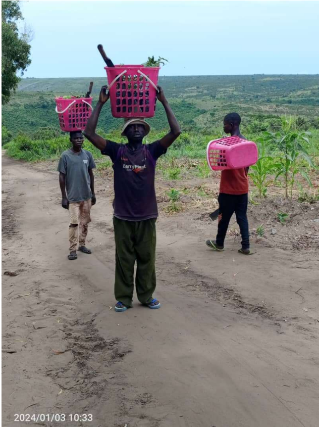
First planting activities