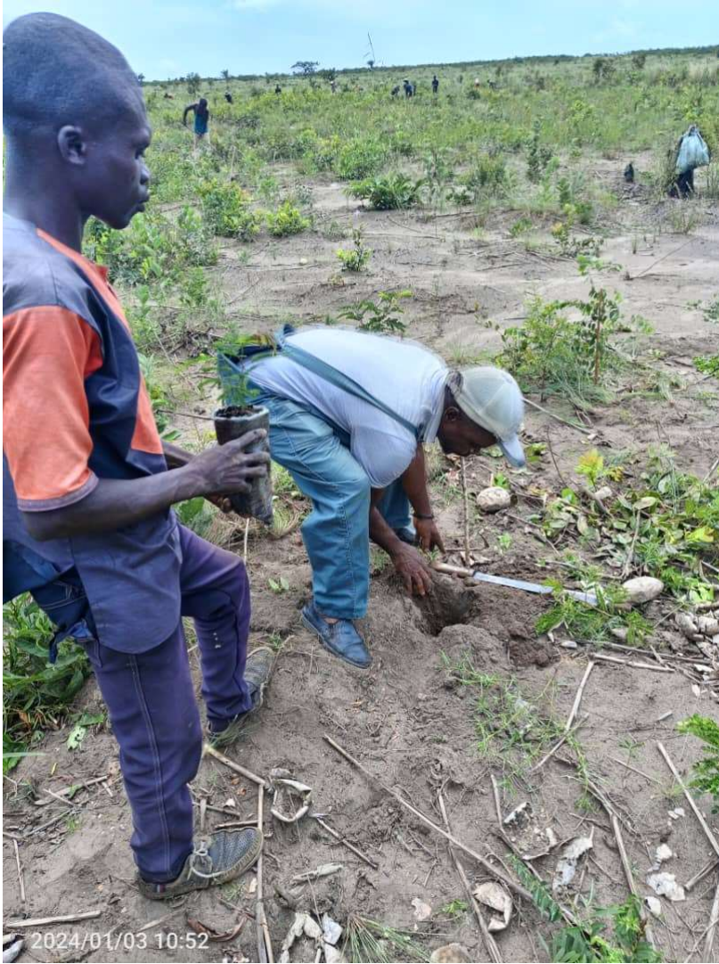
Planting activities in the field