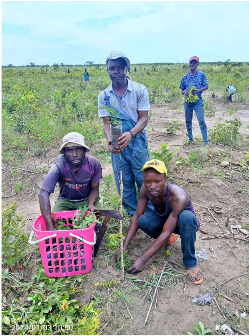
Planting activities in the field