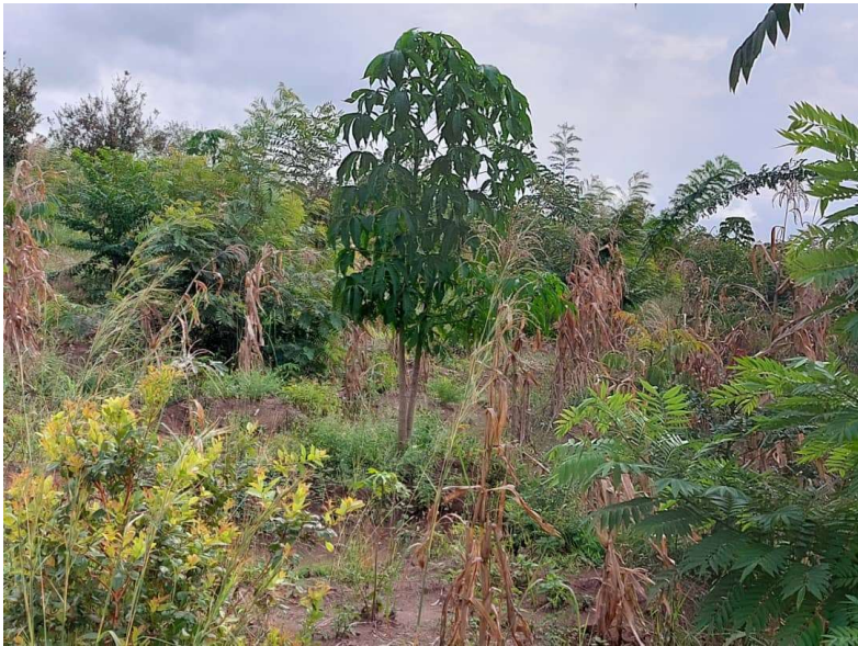
Image of site that was planted in 2022