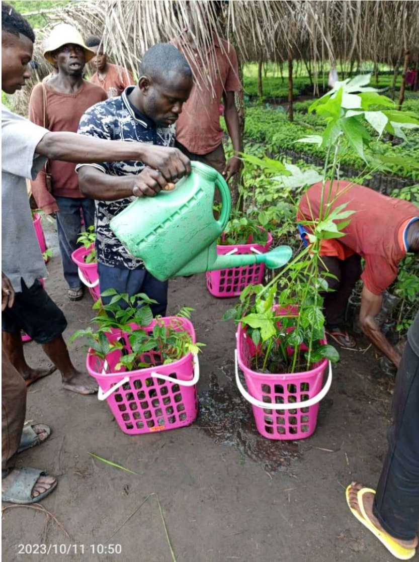
Last watering of the seedlings before planting in the field