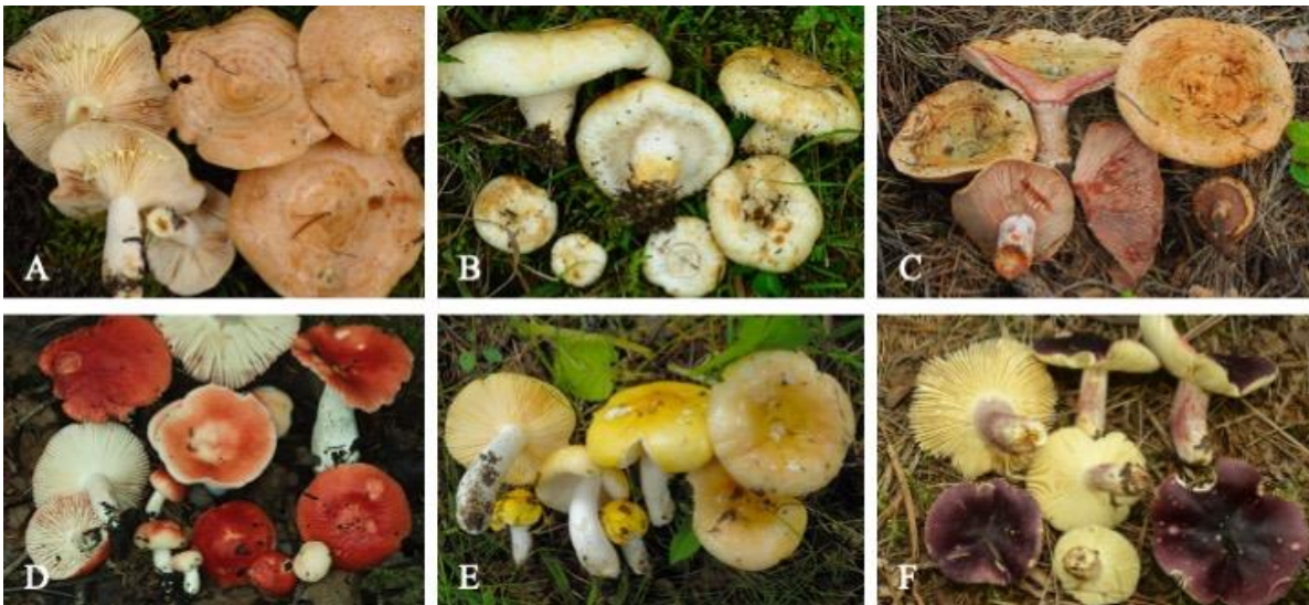
Some of the species found in Saaremaa: a) Lactarius chrysorrheus , b) Lactarius citriolens , c) Lactarius sanguifluus , d) Russula luteotacta , e) Russula risigallina , f) Russula sardonica .

We would like to announce that the next Russulales workshop will take place in Estonian island Saaremaa in a small town of Kuressaare situated on the southwest coast of this largest Estonian island. Saaremaa is covered for 40% by mixed or broadleaf forests, has a mild maritime climate and a variety of soils which offer high expectations for Russulaceae diversity. Every day two or three destinations will be offered for field collecting to get good variety of species and a silent forest experience for everybody. In Saaremaa, you can find stunted vegetation in limestone region that is covered with thin soil, heath forests, dry boreal forests and fresh boreo-nemoral forests. Typical ectomycorrhizal trees are Pinus sylvestris , Betula pendula/ pubescens , Populus tremula , Picea abies , Quercus robur , Alnus glutinosa/ incana , Coryllus avellana , Tilia cordata . Typical landscape of the island was wooded pastures dominated by Juniperus , but they have changed towards forests due to a lack of grazing management. More information about the island is available on: https://visitsaaremaa.ee/en/ .